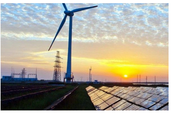
Main services for revenue Renewable energy production and sales to the open market generated by wind and solar (future) energy power plants